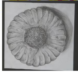
Stage 1: Observational drawing & tone